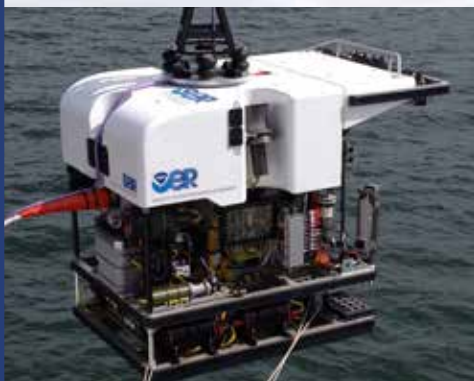
Top to bottom: The NOAA Ship Okeanos Explorer : America's Ship for Ocean Exploration; the control room onboard the Okeanos Explorer ; an octopus hiding; composite multibeam image of Tom's Canyon Complex; NOAA OER's new ROV, Deep Discoverer .