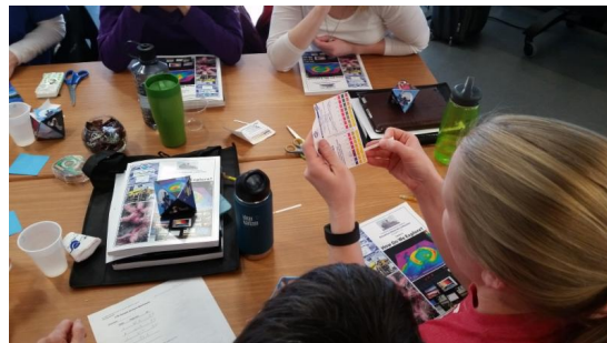
Educators learn about hydrothermal vent chemistry during a professional development workshop in Duluth, Minnesota.